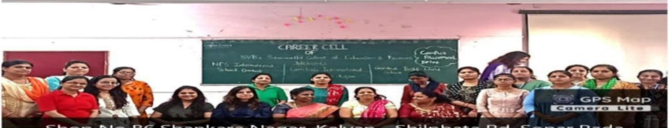
Shop No. PG Chankar, Nagar, Kalyan, Chikabeta Rd, Sonar Pada, Dombivli East, Maharashtra 421203, India