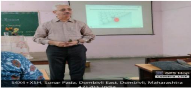
54X4+X5H, Sonar Pada, Dombivli East, Dombivli, Maharashtra 421203, India