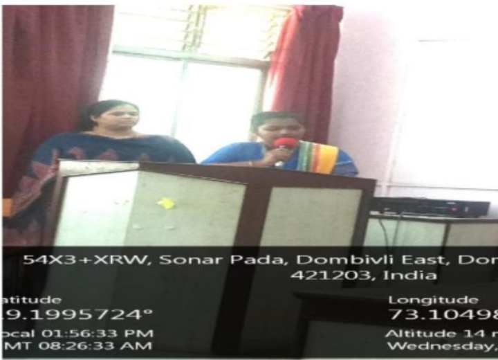
54X3+XRW, Sonar Pada, Dombivli East, Dombivli, Maharashtra 421203, India

Latitude 19.1995724° Longitude 73.104984° Local 01:56:33 PM Altitude 14 meters MT 08:26:33 AM Wednesday, 31.01.2024