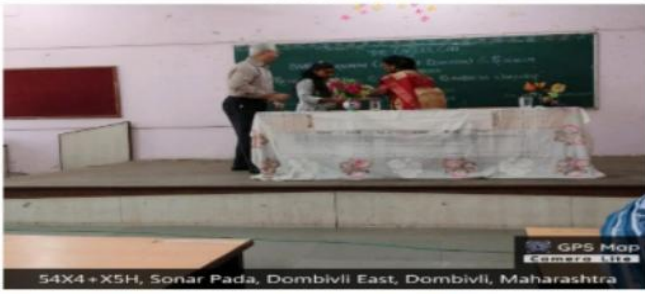
54X4+X5H, Sonar Pada, Dombivli East, Dombivli, Maharashtra 421203, India