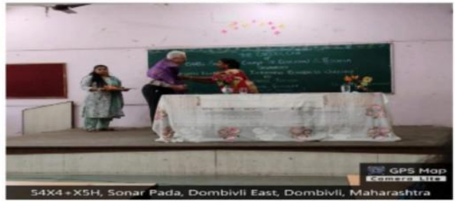
54X4+X5H, Sonar Pada, Dombivli East, Dombivli, Maharashtra 421203, India