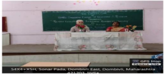
54X4+X5H, Sonar Pada, Dombivli East, Dombivli, Maharashtra 421203, India