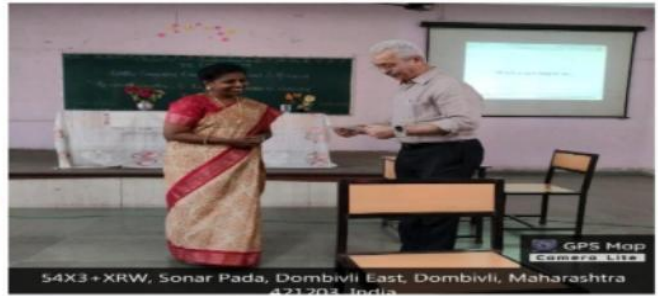
54X3+XRW, Sonar Pada, Dombivli East, Dombivli, Maharashtra 421203, India