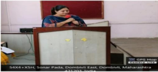
54X4+X5H, Sonar Pada, Dombivli East, Dombivli, Maharashtra 421203, India