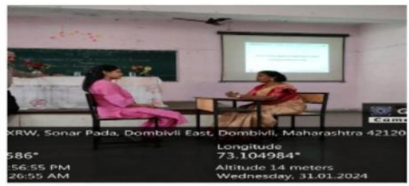
54X3+XRW, Sonar Pada, Dombivli East, Dombivli, Maharashtra 421203, India Latitude 19.1995724° Longitude 73.104984° Local 01:56:55 PM Altitude 14 meters MT 08:26:55 AM Wednesday, 31.01.2024

Latitude 19.1995724° Longitude 73.104984° Local 01:56:33 PM Altitude 14 meters MT 08:26:33 AM Wednesday, 31.01.2024