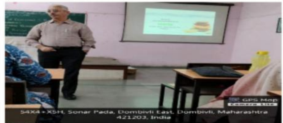
54X4+X5H, Sonar Pada, Dombivli East, Dombivli, Maharashtra 421203, India