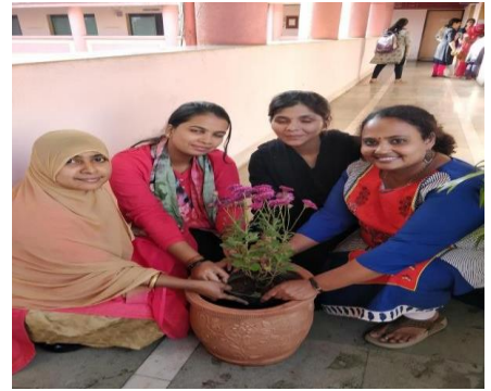
Environment Day celebrated as a symbol of “Go Green and save mother Earth”.