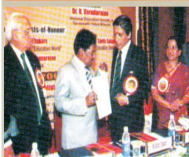
Recognition of the Founder & his Educational Institutions as "Education Leader" by Asia's Famed Magazine 'The Education World' on 14th April, 2006.