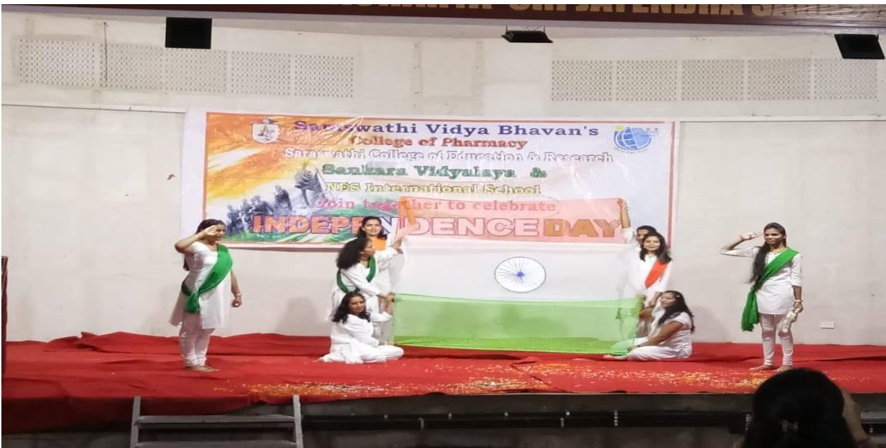
E.C.C.Ed Students performed a dance on Patriotic remix songs on Independence Day.