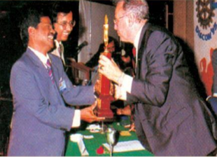
'Best Principal' Award conferred on the Founder by the Rotary International in 1992