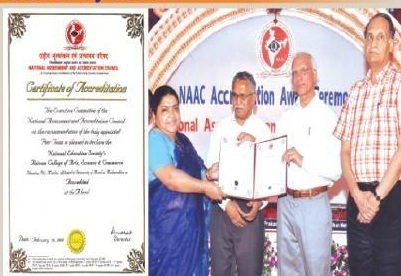
The NES Ratnam College of Arts, Science and Commerce succeeded in establishing its mark facing a rigorous inspection process conducted by NAAC, UGC, New Delhi & was honoured by conferment of "Grade 'A'" in the year 2004